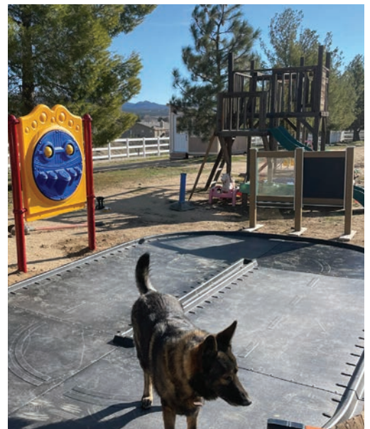
Make A Wish Playground