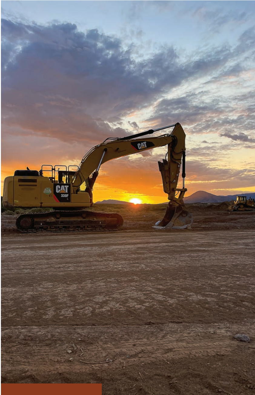
PHOTO OF THE 3RD QUARTER KILROY HOOPER ST (BELOW)