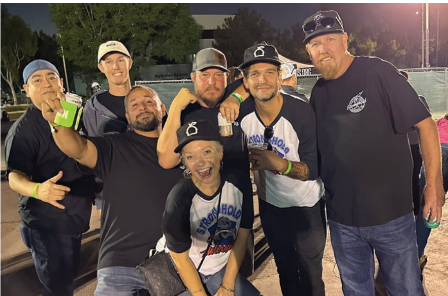
BBBS CORNHOLE TOURNAMENT

Giving back to our community is very important to our organization. Our Charity Committee is always putting their heads together to make heartfelt decisions about the best ways we can give back. In September, Stronghold Engineering sponsored Perris Appreciation Day at The Southern California Railway Museum and the BBBS Cornhole tournament. In October we sponsored American Cancer Society's Construction vs. Cancer Big Dig. In November our corporate office held a food drive to collect goods to donate to local families in need. In December we supported our own Stronghold families in need. We also donated wrapped gifts to Blindness Support Services in Riverside and our team built a playground to fulfill the wish of a young boy through the Make a Wish Foundation.