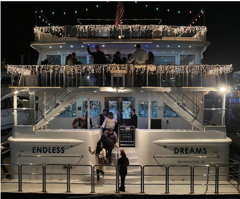
CHRISTMAS HARBOR CRUISE