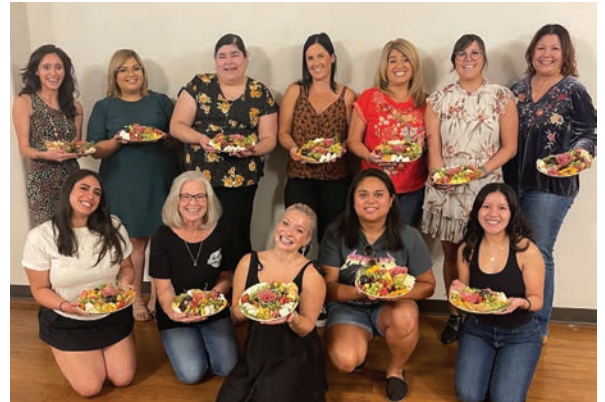
DEEP SEA FISHING (TOP), CHARCUTERIE (ABOVE)