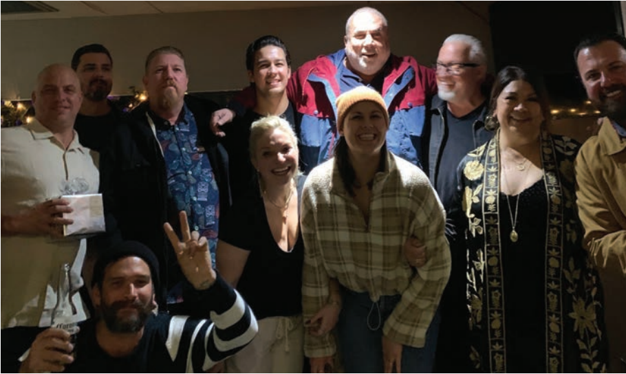
CHRISTMAS HARBOR CRUISE