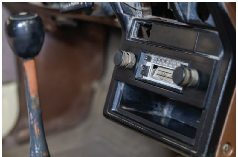
Original 1985 Toyota truck cassette radio