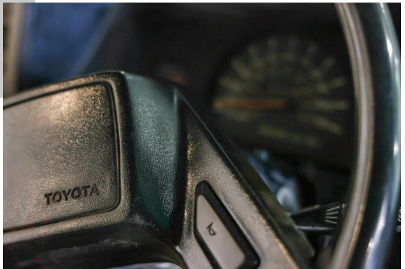
Original 1985 Toyota truck steering wheel