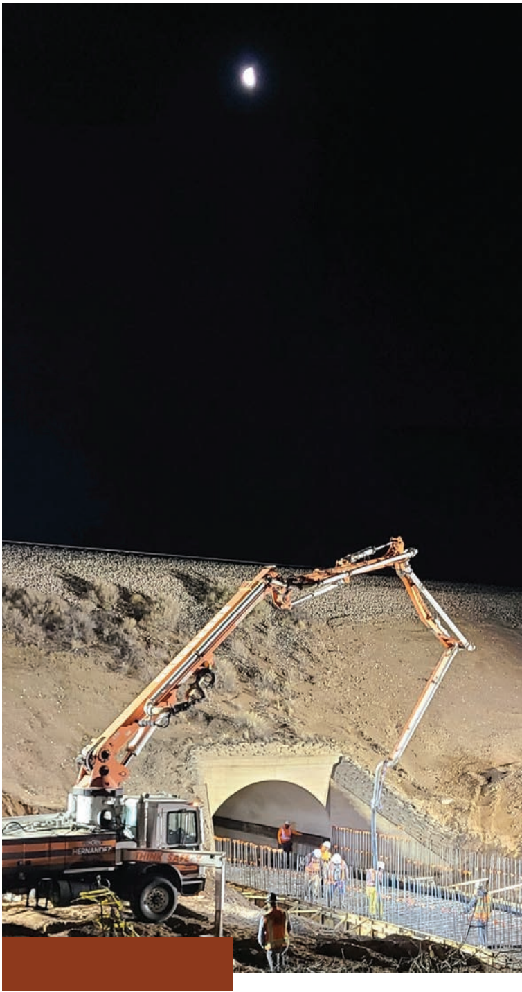
PHOTO OF THE QUARTER OSCURO SIDING EXTENSION

Our Marketing Team is always on the lookout for photos that showcase the work in the field. Send them in! Each quarter we hand-select the best photo we received, awarding a $50 gift card to the winner.